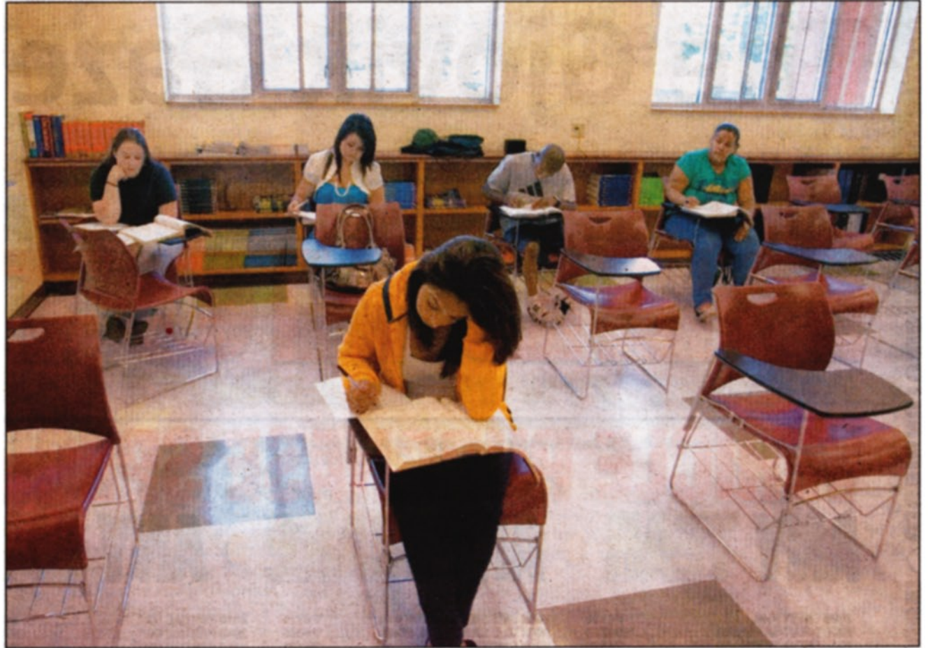
Students at the Dunham Center in Aurora study for their upcoming GED test.